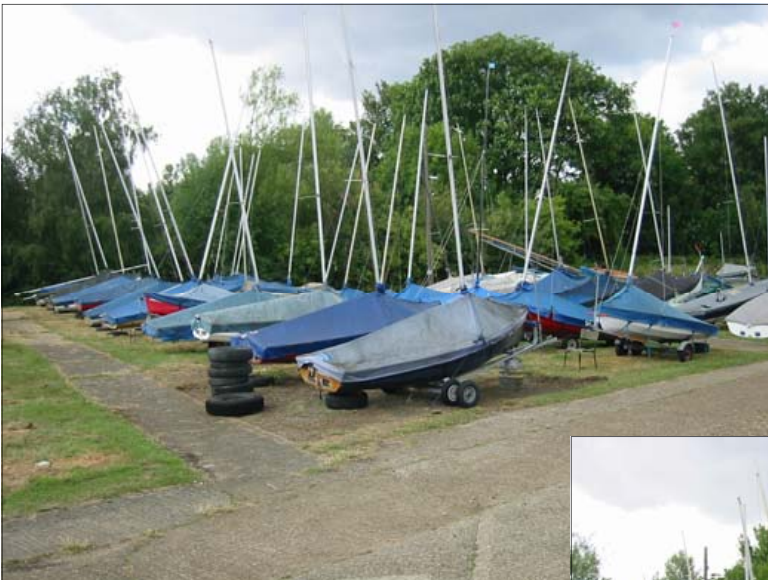
The lovely tidy boat-park

There are also plans to provide an improved area for storing road trailers and, to facilitate this, brambles and overgrown trees are being removed. Any offers of help would be appreciated. We should be able to have quite a good bonfire afterwards!