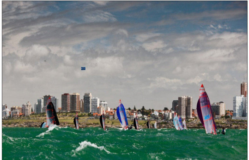
Mar del Plata and the 29er Fleet