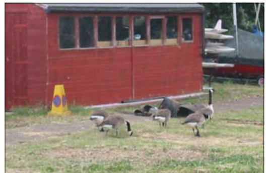
The geese move in...