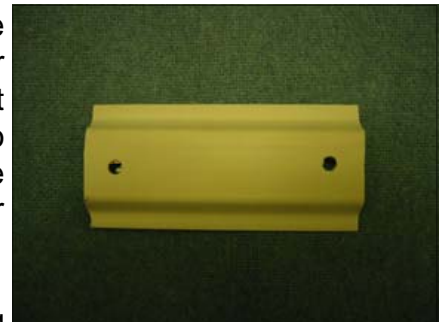
Your white (honest) identification label

An area adjacent to the Workshops has been created for rigging boats and Social events, this will be levelled soon.